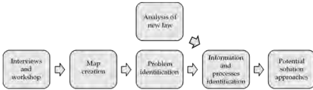
Figure 1 Main steps in the research process